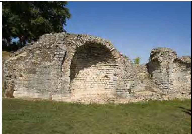
Roman thermal baths