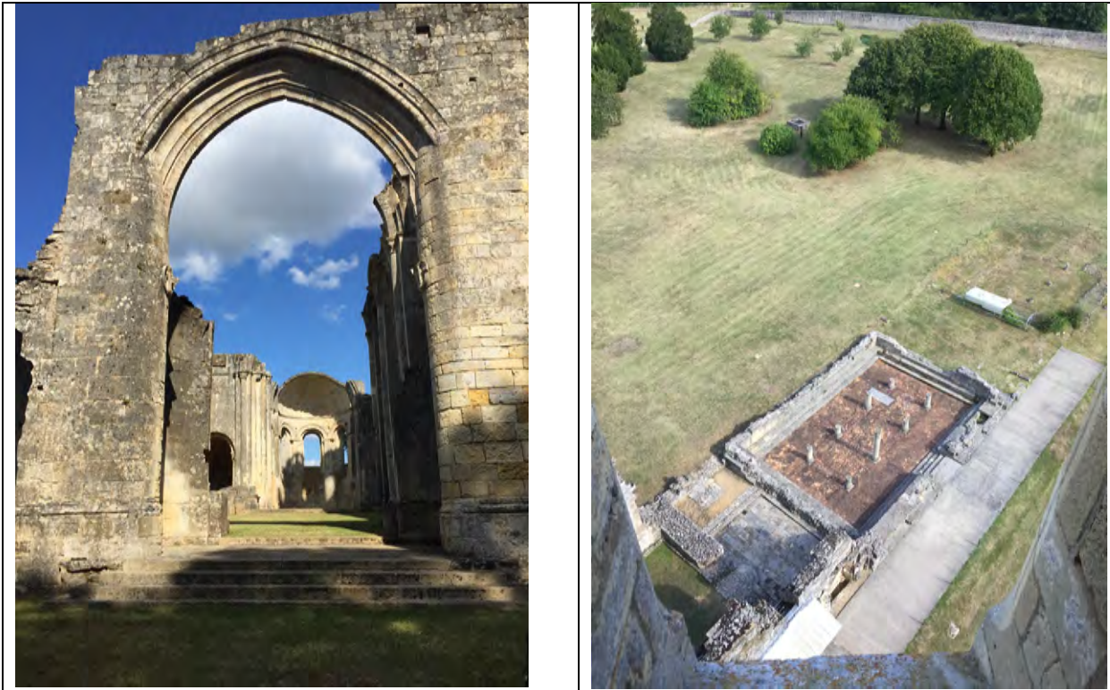
From Abbaye de La Sauve Majeure, Cr on is the last bastide before Bordeaux. But if the day has been long, you can by-pass this one.