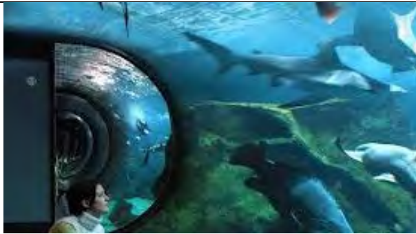
Aquarium of La Rochelle