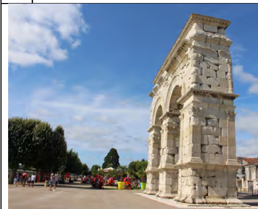
Arc of Germanicus (Saintes)