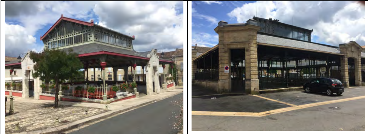
The Pellegrue's cover market (top left) and the cover market of Monségur (top right)

From Sainte Foy La Grande, go to Pellegrue. Pellegrue has a nice halle and a nice church but there is not so much to see there. From Pellegrue go to Monsegur. In between, there is an imposing abbaye at Sainte Ferme but if you want to visit only one Abbaye, concentrate on the Abbaye of La Sauve Majeure. In Monsegur, you can walk along the town walls or just visit the main square with the cover market and the arcades.