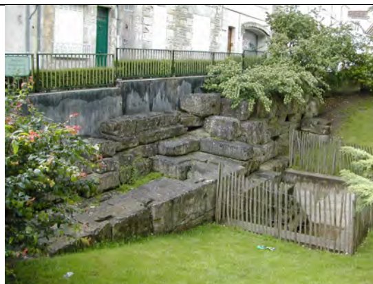
Roman walls (Saintes)