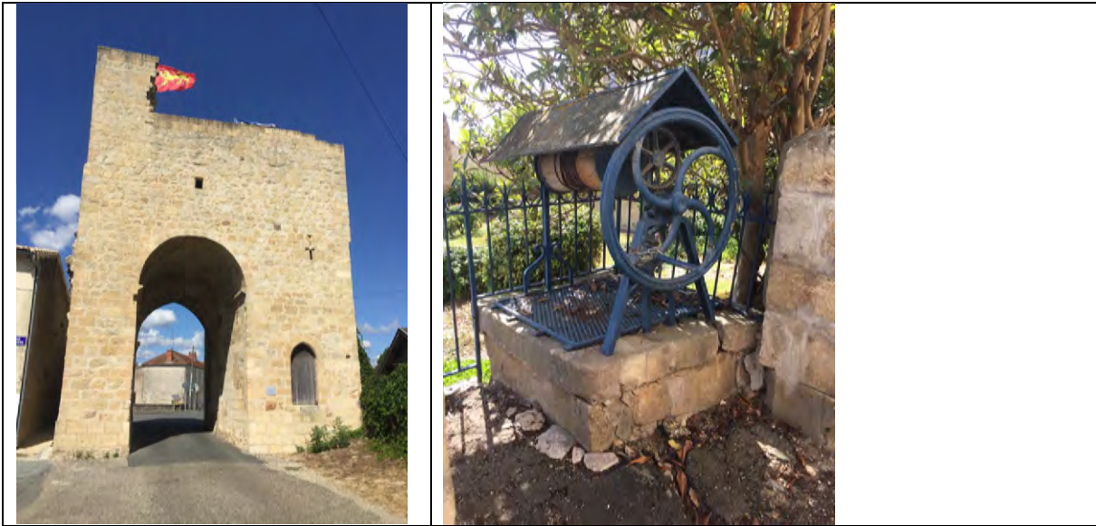
By approaching Bordeaux, don't miss the Abbaye La Sauve Majeure, classed at the world heritage of Unesco.