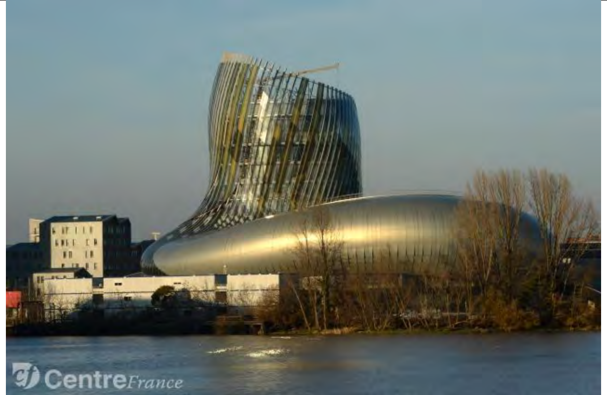
La cité du vin de Bordeaux

If you want to know more about the world of wine (worldwide), the "Cité du Vin" is worth a visit. Book the visit in advance. It should take you at least 3 hours to complete the visit and a complementary glass of wine is included.